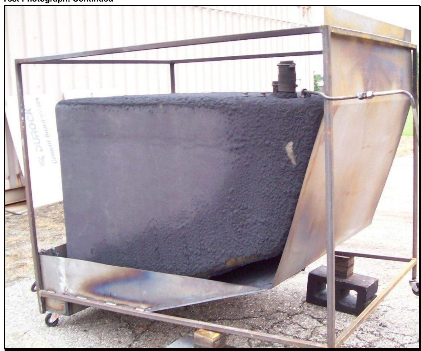
33.20.6 Fuel Tank Fire Post-Test

8C0156-1.1_2.1_3.1_4.1_5.1B Page 16 of 18