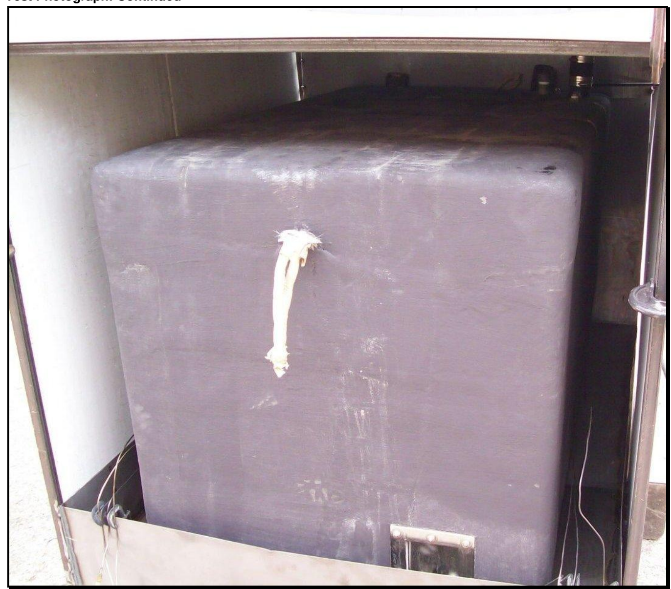
33.20.6 Fuel Tank Fire Test Set-Up

8C0156-1.1_2.1_3.1_4.1_5.1B Page 13 of 18