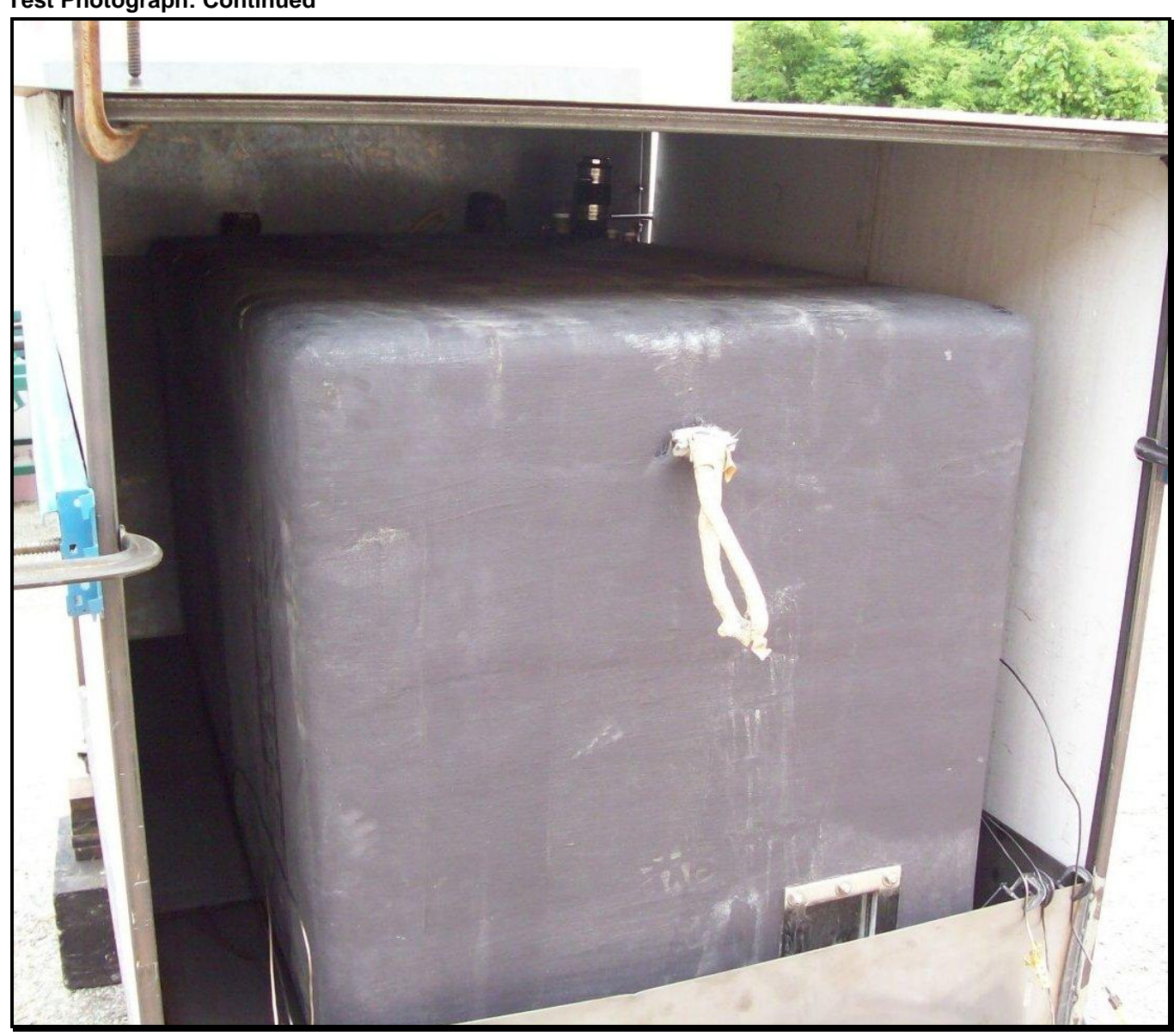
33.20.6 Fuel Tank Fire Test Set-Up

8C0156-1.1_2.1_3.1_4.1_5.1B Page 12 of 18