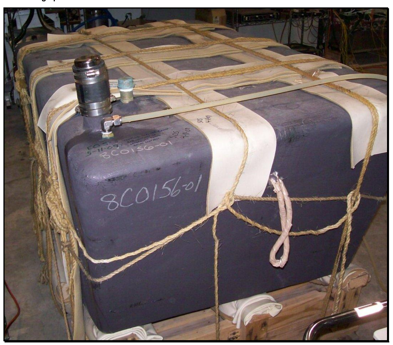
33.21.5 Pressure Impulse Test Set-Up

8C0156-1.1_2.1_3.1_4.1_5.1B Page 11 of 18