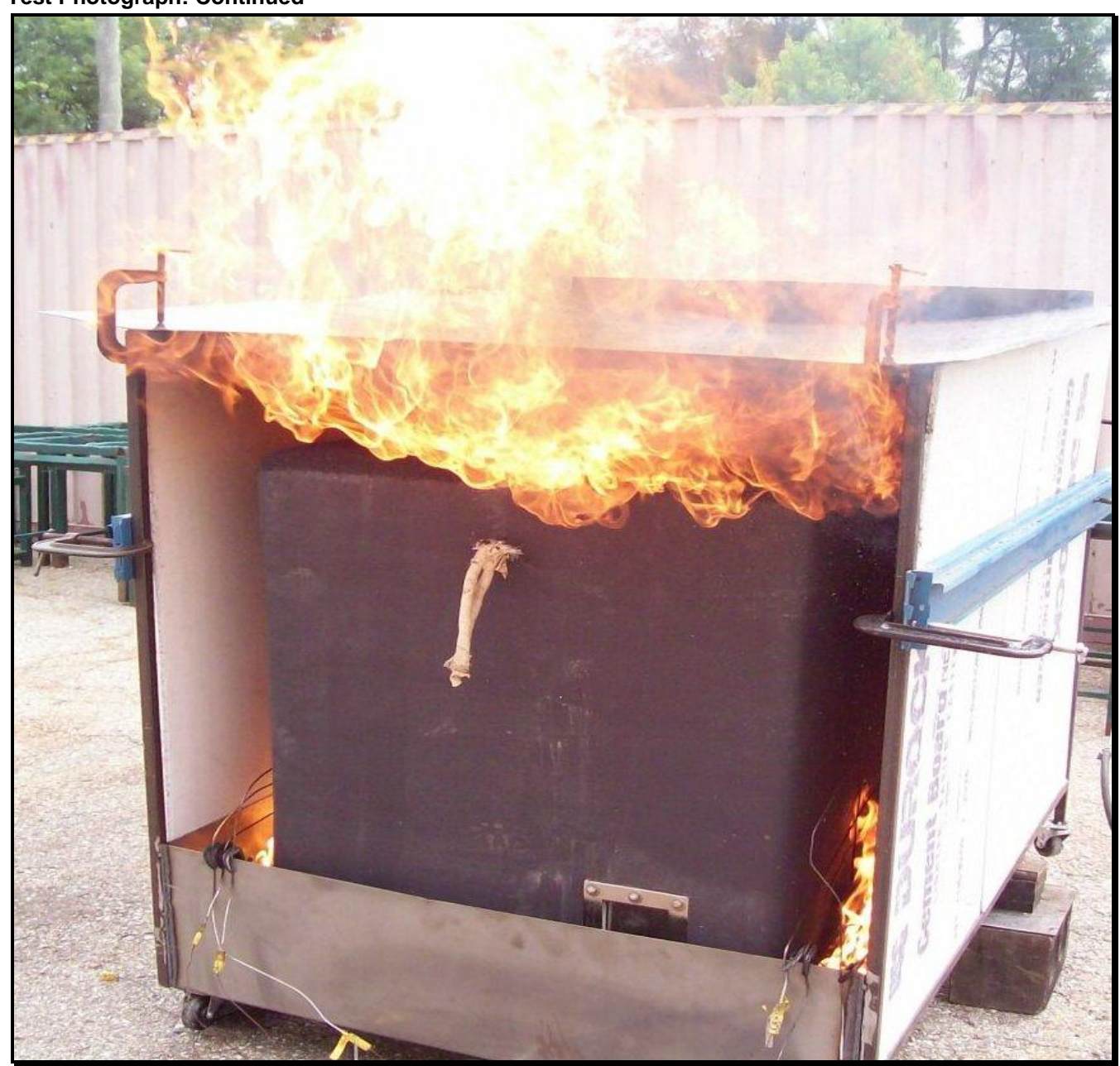
33.20.6 Fuel Tank Fire Post-Test

8C0156-1.1_2.1_3.1_4.1_5.1B Page 14 of 18