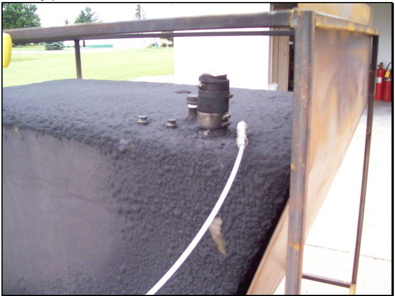
33.20.6 Fuel Tank Fire Post-Test